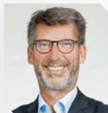
UWE CLASS ZF Friedrichshafen